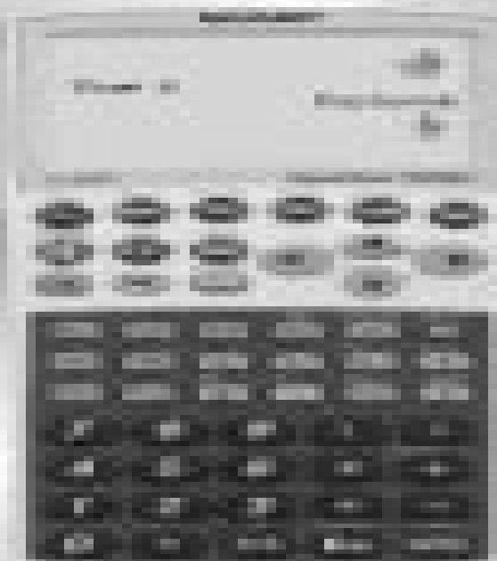
For Basic Levels