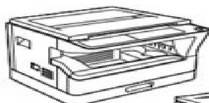
AR-5516 AR-5516S AR-5516D