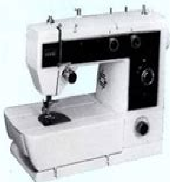
For Flat Bed Sewing