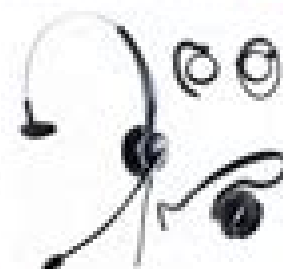
Jabra GN 2100