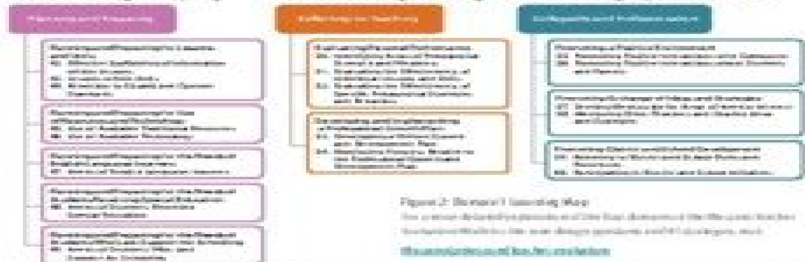
Figure 2: Overview of Planning and Designing

The course is designed to provide a comprehensive understanding of the field of education, including the history, theory, and practice of teaching. The course will focus on the following areas: