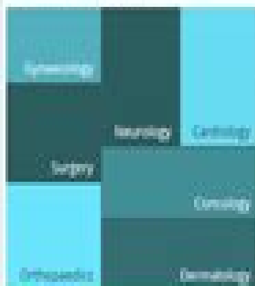
Admission by Division