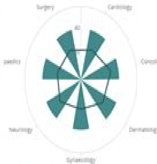
Available Staff per Division