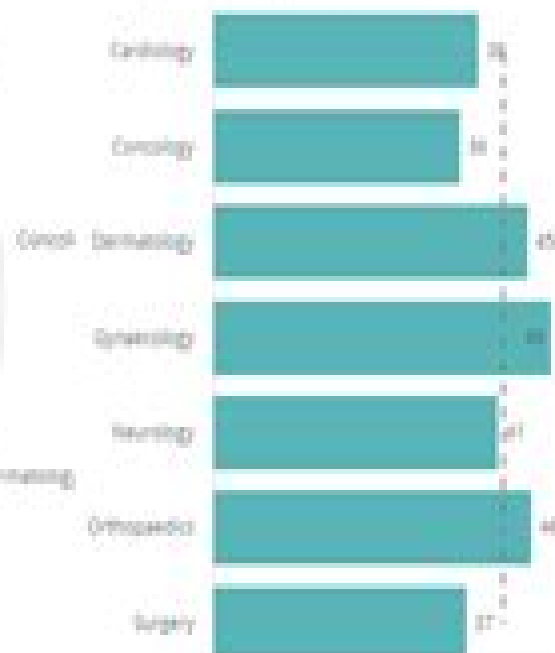
Average Wait Times by Division