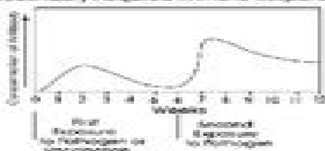
Concentration of Antibody in Primary and Secondary Acquired Immune Response

A vaccination serves as the first exposure to a pathogen and triggers the body's primary immune response. Some vaccines contain weakened or inactive pathogens. Other vaccines contain highly similar but nonpathogenic toxins.