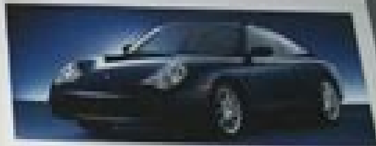
Quick Reference Guide Boxster