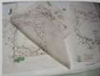
Examples of the use of aerial photography to help with the planning of a site. The aerial photograph of the site is the best way to see the site in its entirety.

The first task of the planning process is to establish the existing form of the site. This can be done by looking at the aerial photograph of the site and the aerial photograph of the site. The aerial photograph of the site is the best way to see the site in its entirety. The aerial photograph of the site is the best way to see the site in its entirety.