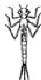
Damselfly Nymph 30 mm