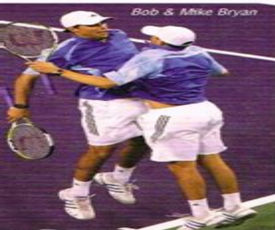
Bob & Mike Bryan