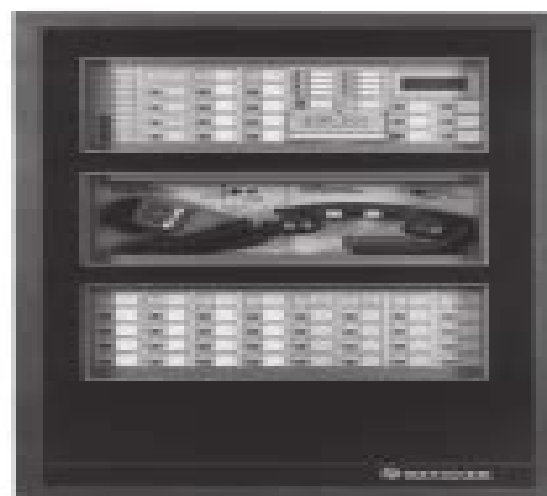
The System 5000 (shown in CAB-C3 cabinet)

programming and system program changes (system has automatic default programming to general alarm).