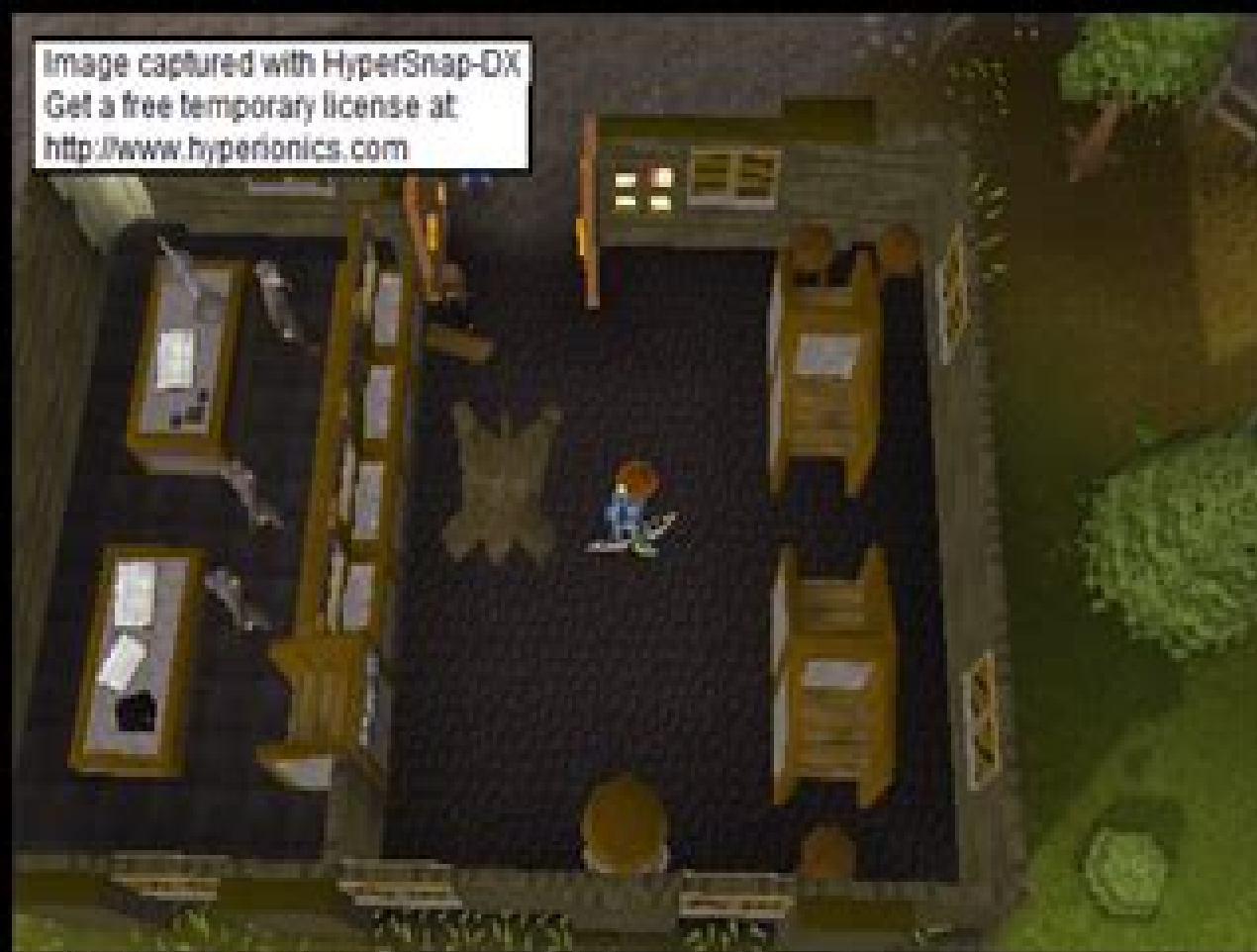
Image captured with HyperSnap-DX Get a free temporary license at http://www.hyperionics.com