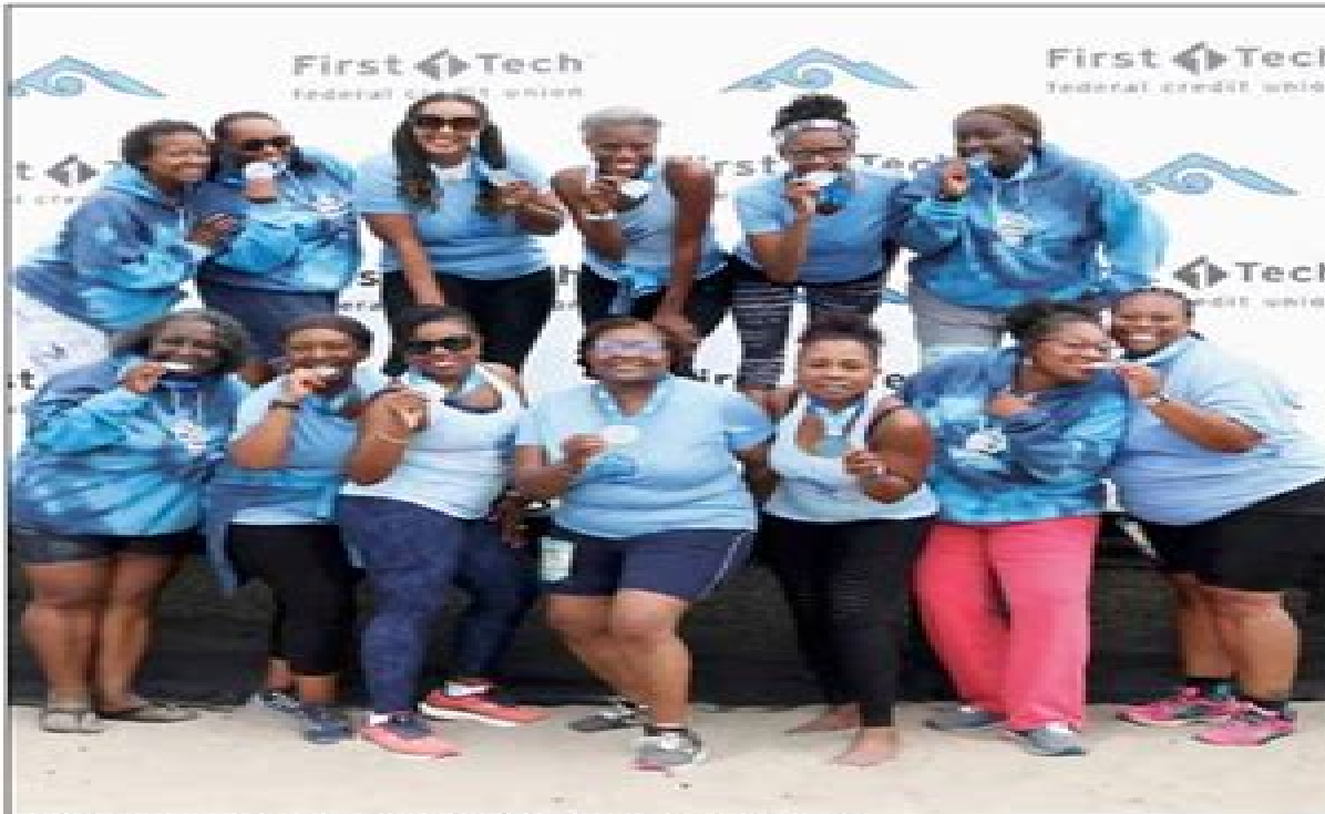
Runners pose at the end of the hood to coast relay.