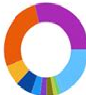
Portfolio by Security