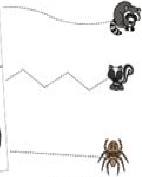
Wavy, Zigzag, Dotted