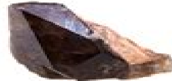
morion (smoky quartz)