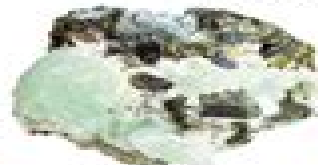
prehnite with epidote