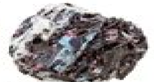
kyanite, biotite, tourmaline on gneiss