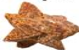
glendonite (ikaite calcite)