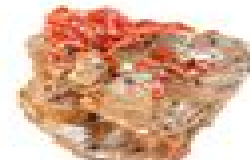
vanadinite on rock