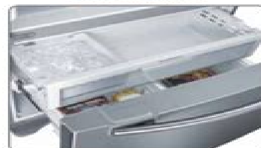
Filtered Dual Ice in Freezer.