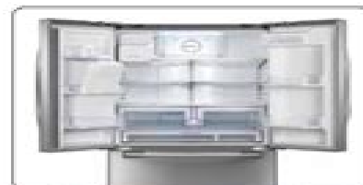
French Door design provides easy access to fresh food and flexible storage options.