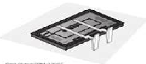
Part No. : SMT-3223-0001