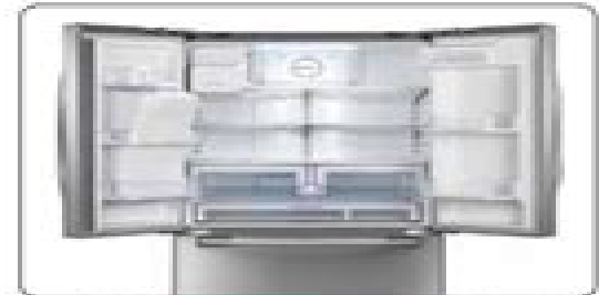
French Door design provides easy access to fresh food and flexible storage options.