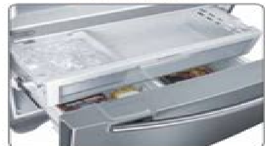
Filtered Dual Ice in Freezer.