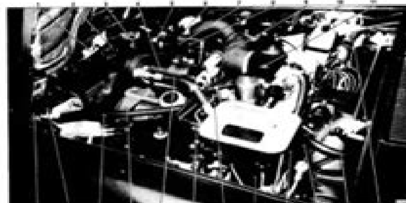
Fig. 23 General view of engine compartment - left side

1. Remote starter switch 2. Control rod and nut 3. Compensator linkage 4. Remote starter switch 5. Engine from engine compartment 6. Engine from engine compartment 7. Engine from engine compartment 8. Engine from engine compartment 9. Engine from engine compartment 10. Engine from engine compartment 11. Engine from engine compartment 12. Engine from engine compartment 13. Engine from engine compartment 14. Engine from engine compartment 15. Engine from engine compartment 16. Engine from engine compartment 17. Engine from engine compartment 18. Engine from engine compartment 19. Engine from engine compartment 20. Engine from engine compartment