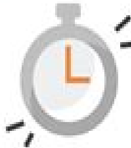
Ability to Work Under Pressure and Time Management