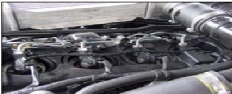
Rocker Cover ZD30DDTi CRD (2007)