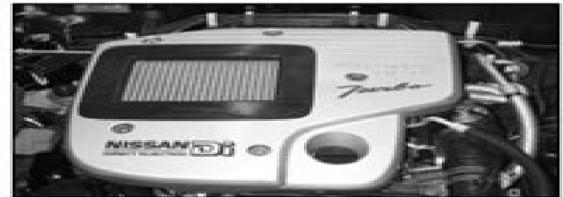
ZD30DDTi (Non CRD; 2000 – 2006)

Note 5; ZD30 engine also applied to D22 Navara models from late 2001 ~ 2006 production. Engine has a conventional turbo, but no intercooler. (ZD30DDT)