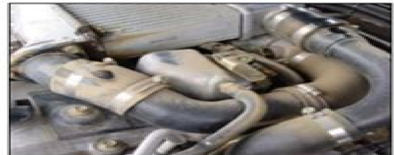
Rocker Cover ZD30DDTi (2000 – 2006)