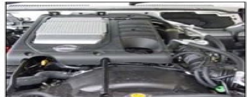
ZD30DDTi (CRD; 2007)