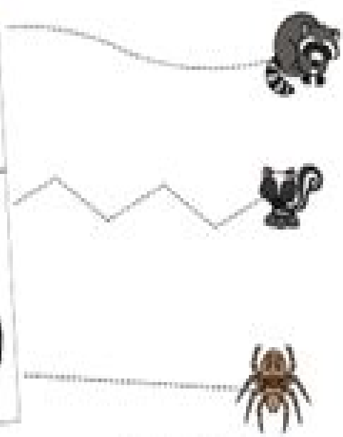
Wavy, Zigzag, Dotted