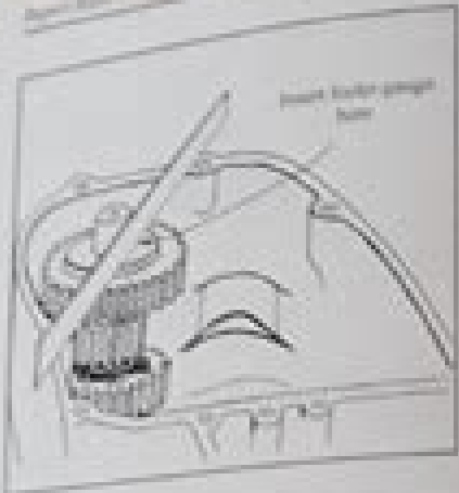
Fig 9.14 - Checking selector fork and sleeve (1971-74)