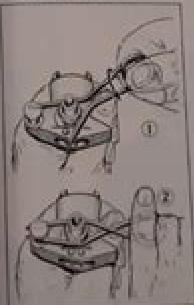
Fig 9.16 - Fitting gear change spring

There should also be no gap in the spring when the selector is in the sleeve. If you are not happy with the fit of your new spring, take it back to the vendor and compare it with the quality of the parts from the donor.