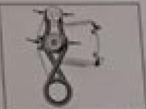
Fig 9.17 - Contact point indicated by wire