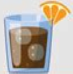
Ice in soda