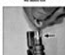
6.10f Remove the fuel rail support bracket