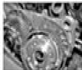
6.10d Remove the fuel rail support