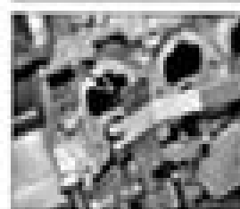
6.10h Tighten the tension to the fuel rail support

6.10g Fit the crankshaft sprocket to the engine (A) (Illustration courtesy of Bentley Motors. Tools not used with fuel rail permission)