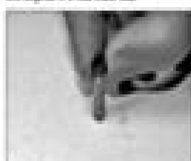
6.10c Remove the fuel rail support bracket

6.10b The fuel injector is fitted to the engine (A) (Illustration courtesy of Bentley Motors. Tools not used with fuel rail permission)