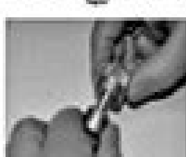
6.10d Remove the fuel rail support bracket