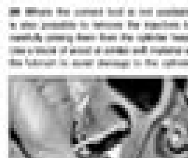
6.10i Remove the fuel rail support