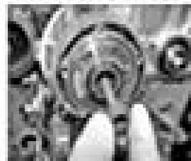
6.10b Remove the fuel rail support bracket from the fuel rail support (A) (Illustration courtesy of Bentley Motors. Tools not used with fuel rail permission)

6.10a Remove the fuel rail support bracket from the fuel rail support (A) (Illustration courtesy of Bentley Motors. Tools not used with fuel rail permission)