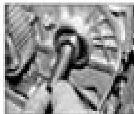
6.10e Remove the fuel rail support

6.10f Using the key, remove the fuel rail support bracket from the fuel rail support (A) (Illustration courtesy of Bentley Motors. Tools not used with fuel rail permission)