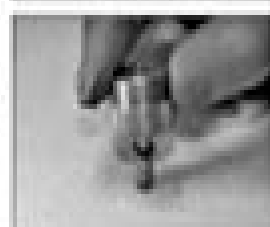
6.10e Remove the fuel rail support bracket