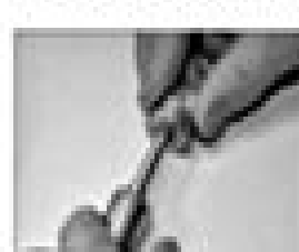
6.10k Remove the fuel rail support bracket

6.10j Fit the fuel rail support bracket to the fuel rail support (A) (Illustration courtesy of Bentley Motors. Tools not used with fuel rail permission)