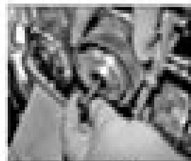
6.10c Remove the fuel rail