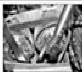
6.10b Tighten the tension to the fuel rail support