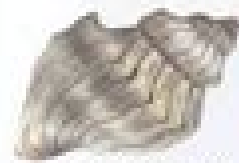
Frilled Dogwhelk (W)

Collispira ligata To 1 in. (2 cm) high Pearl-like, strongly ridged shell is as wide as it is high.