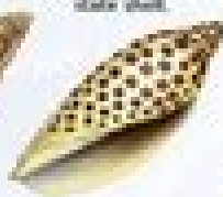
Johnstone's Junonia (CB, CB)

Nassarius trilineatus To 1 in. (2 cm) high Whitish shell has 4-6 beaded spiral ridges. Southern specimens often have 3 spiraling red brown lines.