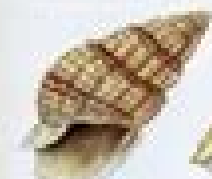
Three-lined Nassa (E)

Macrosipha carolinensis To 2 in. (5 cm) Large, brown shiny and shell is white-spotted. Note prominent teeth lining central opening.