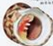
Bleeding Tooth (CB)

Nucella lamellosa To 2 in. (5 cm) Brown to white shell has body seal frills and spines. Species found in shallow waters have smoother shells. Found in intertidal waters.