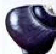
Black Top Shell (W)

Polinices bipartitus To 1 in. (2.5 cm) high Rounded shell is grayish to brownish, (dark to red) to bore holes into biofilms.