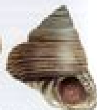
Ribbed Top Shell (W)

Hydrobia ulitiformis To 1 in. (2 cm) high Cone-shaped shell is blackish to brownish-gray. Feeds on biofilms.