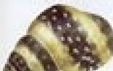
Checkered Periwinkle (W)

Littoraria maritima To 1 in. (2 cm) high Grayish-white, sculpted shell has low spiral ridges. Common in marshes and estuaries.