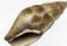
Carinate Downsail (W)

Chamaelea pumila To 4.5 in. (11 cm) Yellow-white to brownish shell has raised ribs but lacks long spines. Note brown spots on outer lip of shell.