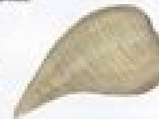
Common Fig Shell (CB)

Hydrobia ulitiformis To .75 in. (2 cm) Very fragile white to yellowish shell has a delicate lip. Shells are so light they are often transported to the highest tide line.