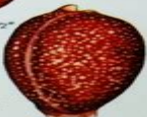
Deer cowrie 7"