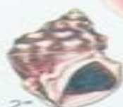
2" Florida rock shell