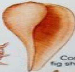
Common fig shell 3"