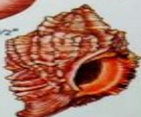
Apple murex 3"