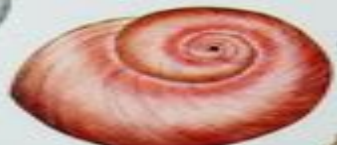
Shark's eye 2 1/2"