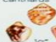
1/2" Common dove shell