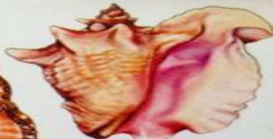
Pink conch 8"