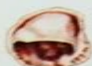
Atlantic slipper shell 1 1/2"