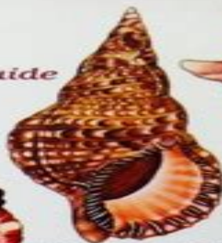
Triton's trumpet 9"