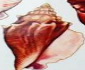
Florida fighting conch 3"