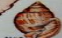
1 1/2" Common nutmeg