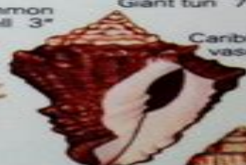
Caribbean vase 3"