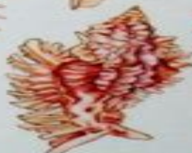
Lace murex 2"