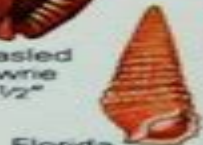
Florida cerith 1"