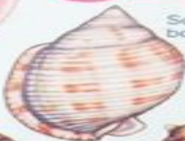
Scotch bonnet 3"