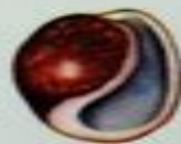
Bubble shell 1 1/2"