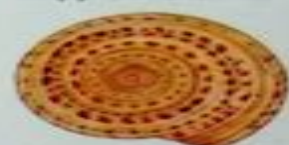
Atlantic sundial 1 1/2"