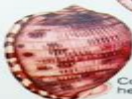
Cowrie helmet 2"