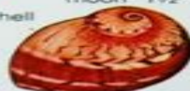
Gaudy natica 1 1/2"