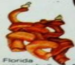
Florida worm shell 4"