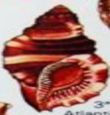
3" Atlantic hairy triton