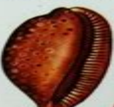
Measled cowrie 3 1/2"