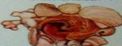
Atlantic carrier shell 2"