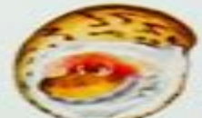
Bleeding tooth 1"