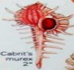
Cabrit's murex 2"