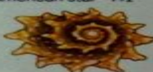
Long-spined star 2"