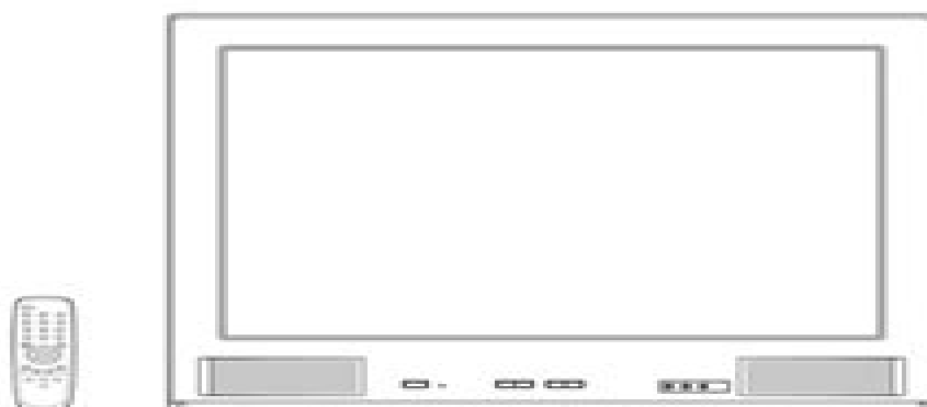
Illustration of DTV2760

If you purchase a universal remote control from your local retailer, please contact the remote manufacturer for the required programming code.