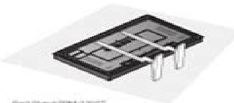
Part No: VESA-3200-2000