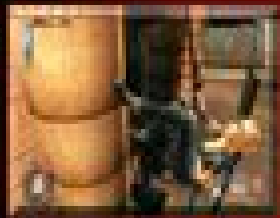
Did you shoot, sneak, or do anything more?