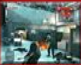
Explosion over it and terrorist ops in the air