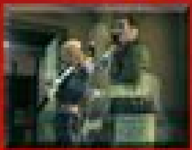
So what? She's a covertly covert agent

"With originality and gameplay variety fueling every second of play, Rogue Ops is a mission that's worth taking." — Game Informer .