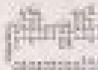
Figure 1—Roberts' Radio Model R77