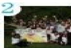
2 Wales and Borders youth shine