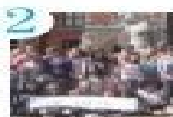
2 It Starts With Me, It Starts Today!