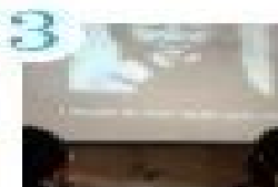
3 Hiroshima Peace Day