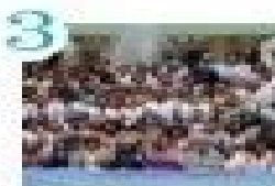
3 One Europe With Sensei