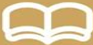
Reading Comprehension test