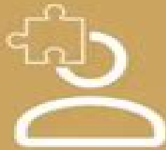
Problem Solving test