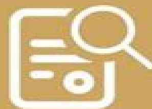
Attention to Detail test