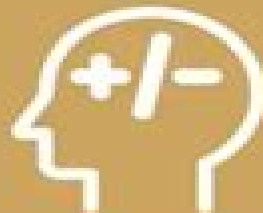
Numerical Reasoning test