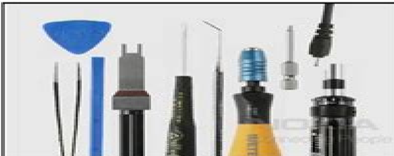
1. Needed tools: SRT-6, metal tweezers, SS-93, SS-45 camera removal tool, a straight bladed screwdriver, dental pick, bit holder with a torx plus size 6 bit, a torque driver, DC plug