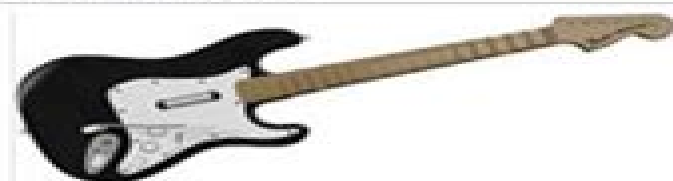
Rock Band Stratocaster