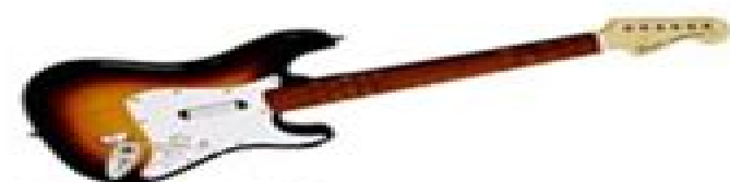
Rock Band 2 Stratocaster