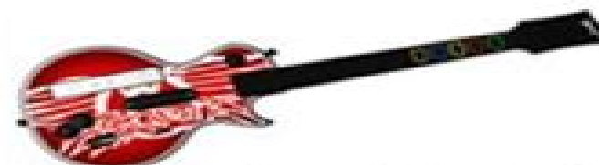
Guitar Hero: Aerosmith Les Paul (with Wiimote)