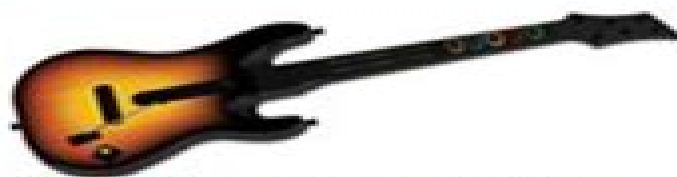
Guitar Hero: World Tour Genericaster