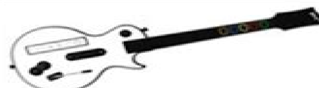
Guitar Hero 3 Les Paul (with Wiimote)