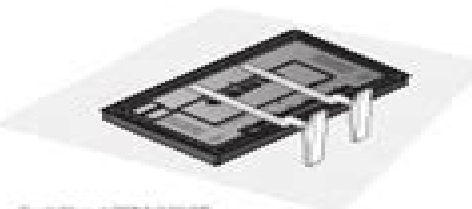
Part No.: 20-40-141