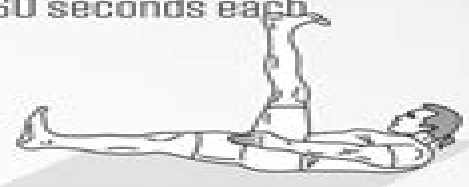
3. Low Boat Pose Scissors Variation Low Navasana Scissors Variation