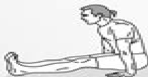
7. L-sit into full bridge Brachmacharyasana to Setu Badhasana Variation