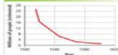
Native American Population of Central Mexico