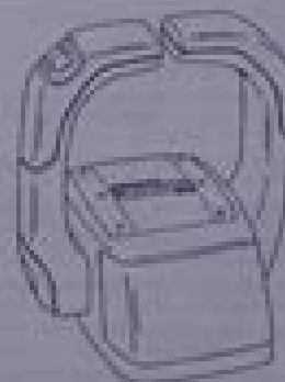
COMMANDER 3000 DUAL HANDLE CONSOLE MOUNT REMOTE CONTROL