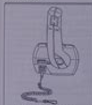
COMMANDER 3000 PANEL MOUNT REMOTE CONTROL