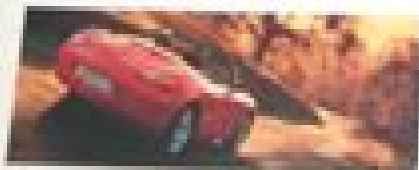
Musik CD Musik CD