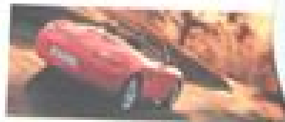
Musik CD Musik CD