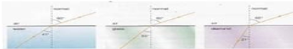
Reflection and Refraction