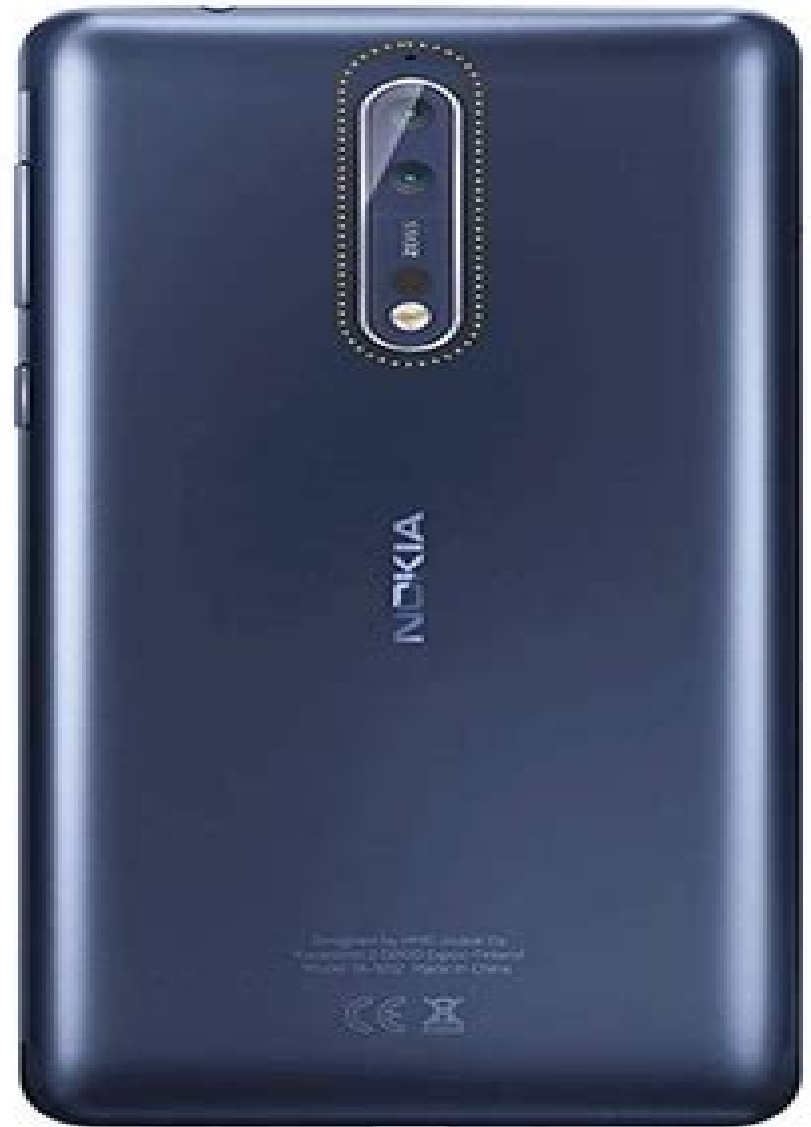
Nokia 8 5.3" NPU