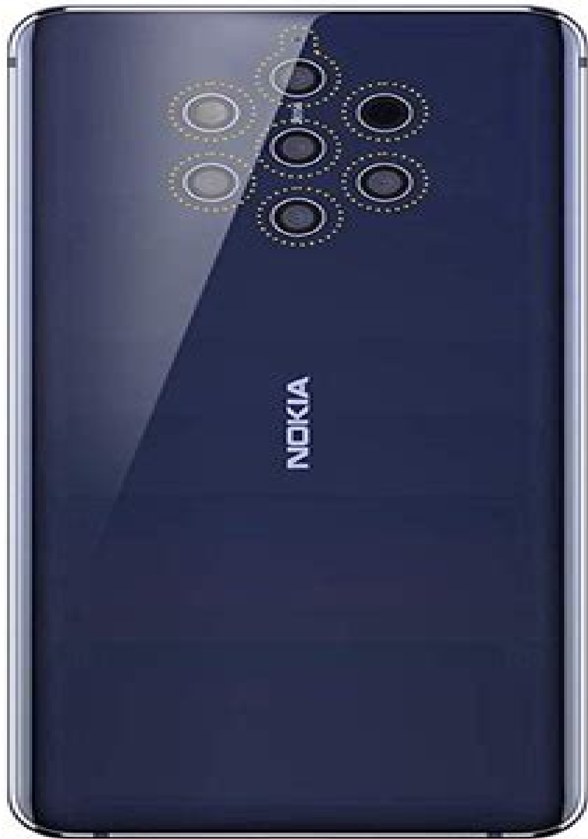
Nokia 9 5.9"