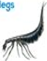
Water beetle larva