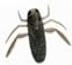
Lesser water boatman