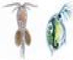
Water fleas (hydra and daphnia)