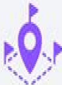
Territorial Sales Forecasting