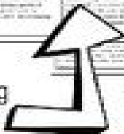
Vocabulary words for Focus or word wall