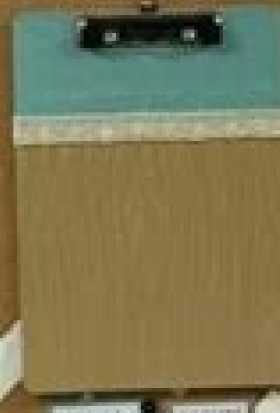
Young Men & Scouts