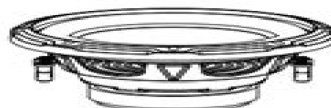
SUB 12 DUAL