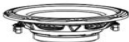
SUB 10 DUAL