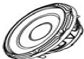
SUB 10 SLIM