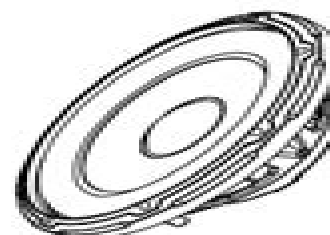
SUB 12 SLIM