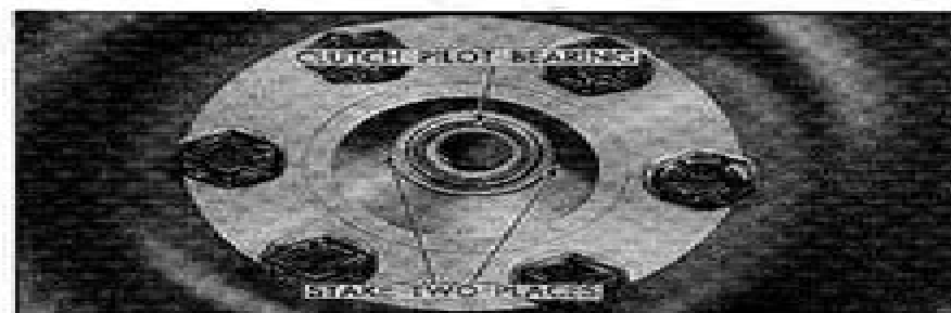
Fig. 6-49 Clutch Pilot Bearing Staked